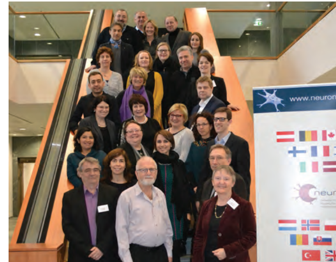
The participants of the NEURON Cofund kick-off: scientists, ministry representatives and project managers of funding agencies. Federal Ministry of Education and Research (BMBF) in Berlin, Germany, January 2016.

The Excellent Paper in Neuroscience Award (EPNA) addresses early career scientists (ECS) and is one of NEURON's support activities for this particular group. The annual award is bestowed upon the most remarkable and outstanding scientific publications by an ECS in the field of disease-related neurosciences. The award laureates present their work in a designated symposium during an international conference. This offers high visibility to the ECS and to NEURON.